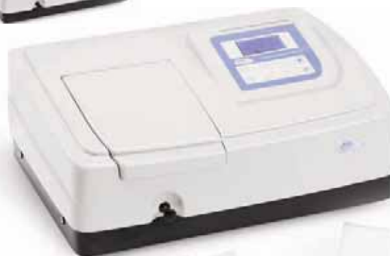
"VR-2000" Part no. 4120026