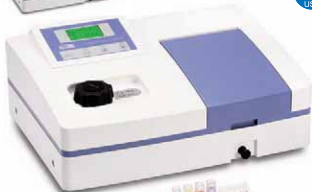
"V-1100" Part no. 4120025