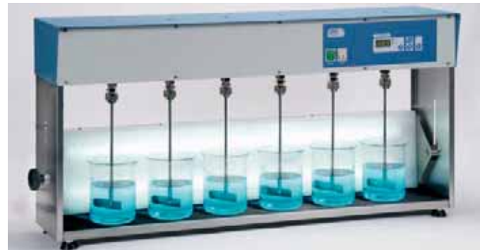
Flocculator "Flocumatic" with horizontal and vertical illumination (6 places).