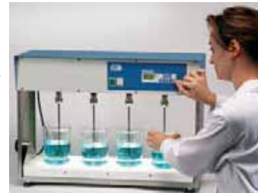
Flocculator "Flocumatic" with horizontal illumination (4 places).