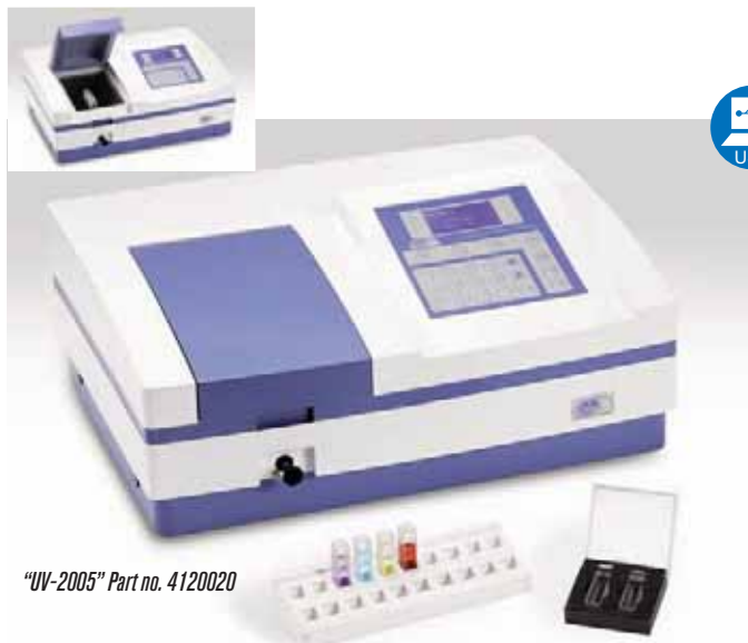
"UV-2005" Part no. 4120020

AUTOMATIC WAVELENGTH POSITIONING AND BLANK SETTING