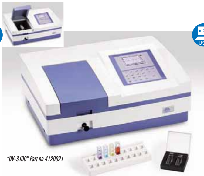
"UV-3100" Part no 4120021