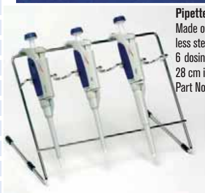
Pipette rack. Made of AISI 304 stainless steel. No. of places: 6 dosing pipettes up to 28 cm in length. Part No. 1001215