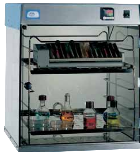
Incubation chamber "Boxcult" Part No. 3000957 with base Part No. 3001172 and support rack with two shelves Part No. 1000973. Supplied as accessories.

Stainless steel rack with 4 shelves positions, each one separated by 9 cm. Comes complete with 2 removable shelves. Useful dim. 43 cm long and 41 cm wide. Part No. 1000973